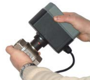
Manual valve opening and closing possible, in case of a power failure