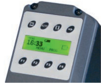
Built-in quartz controlled timer with LCD display