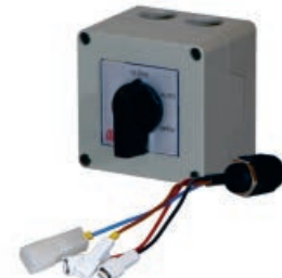
Remote control option