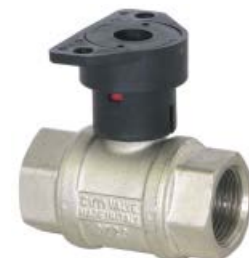
Nickel plated brass with stainless steel ball

JORC is NEN - EN - ISO 9001:2015 certified