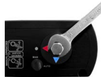
Manual valve opening and closing possible, in case of a power failure