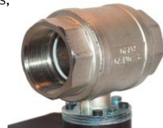
Nickel plated brass with stainless steel ball

JORC is NEN - EN - ISO 9001:2015 certified